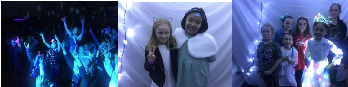
Last Friday was a night of fun and excitement at the Winter Wonderland Disco.