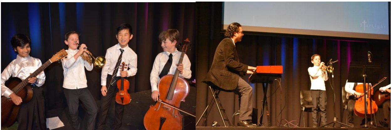
Our St Mary's School band at the Starlight Festival.